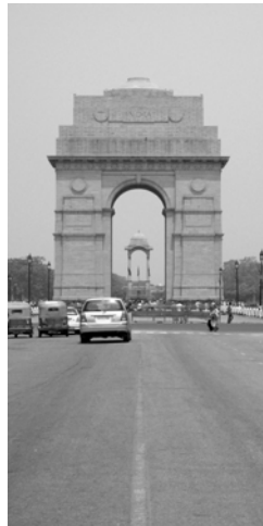
India Gate